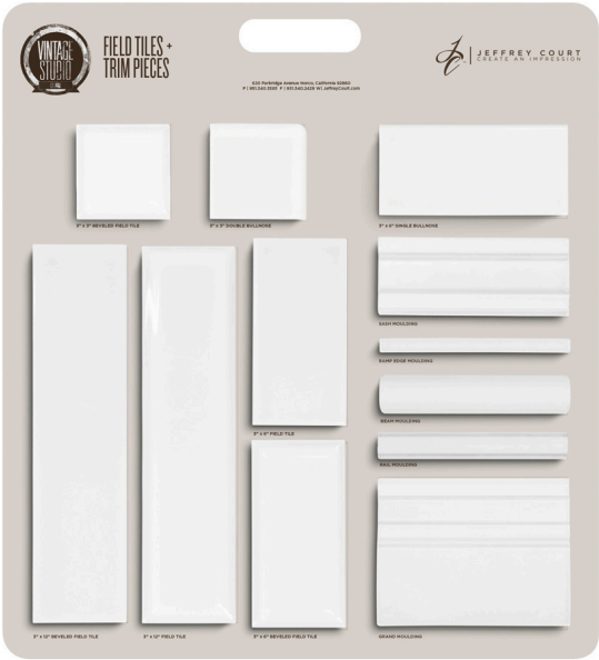
CHAPTER 2 PARTS & PIECES BOARD A (FRONT)