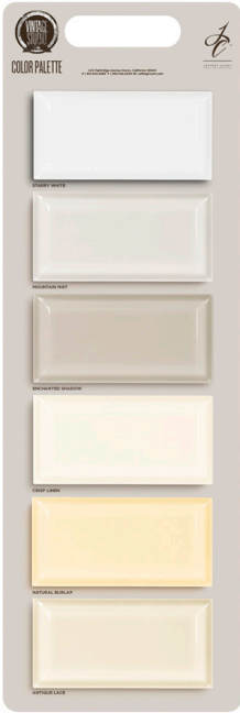
CHAPTER 2 COLOR PALLET BOARD B