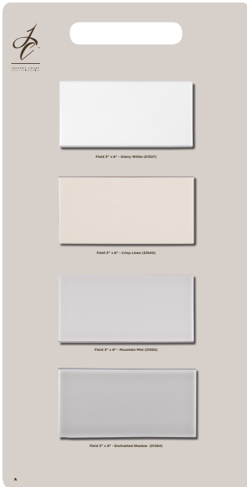
CHAPTER 5 DB A (FRONT)