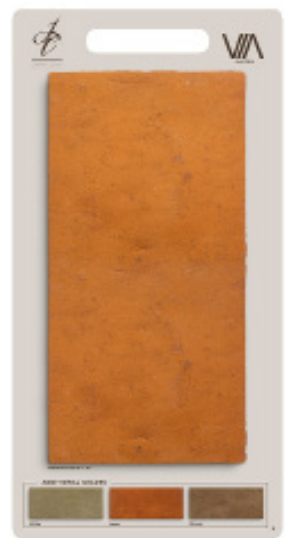
CHAPTER 4 BOARD C (FRONT)