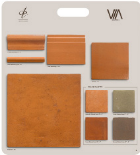
CHAPTER 4 BOARD A (FRONT)