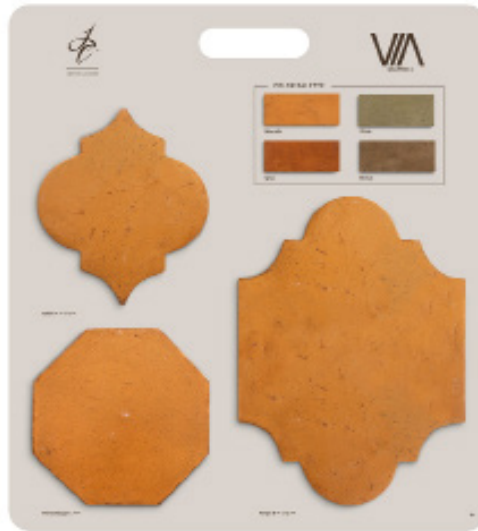
CHAPTER 4 BOARD B (FRONT)